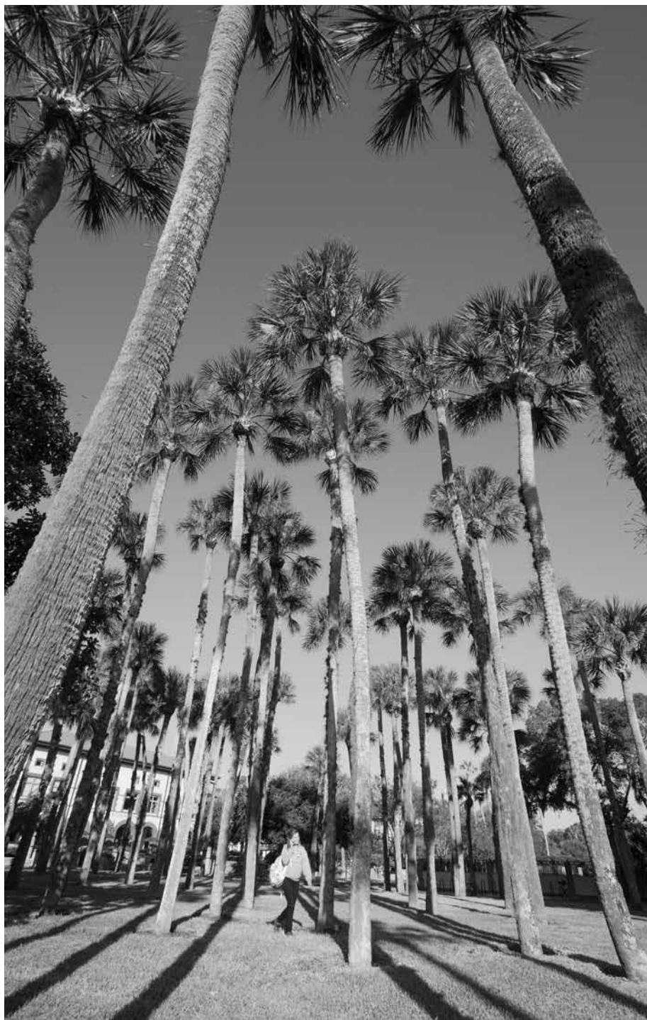
The Palm Garden adjacent to the former Hotel Ponce de Leon is a peaceful common area situated in the heart of St. Augustine.