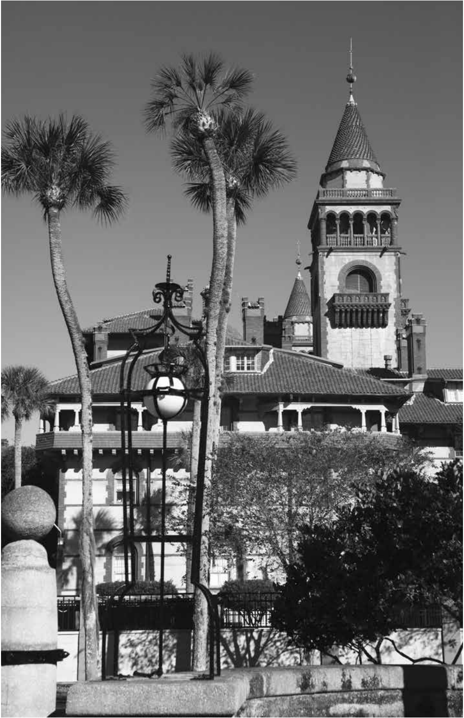
Students are surrounded by the unique historic buildings of Flagler College, hailed as one of the best examples of Spanish-Moorish Renaissance architecture in the world.