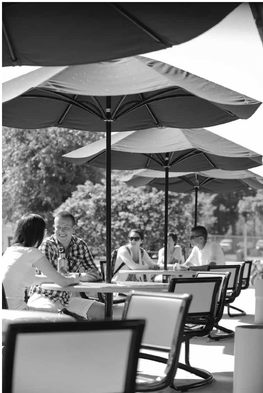
Students enjoy congregating at the outdoor dining/lounge/study area of the Ringhaver Student Center, taking advantage of St. Augustine's comfortable weather.