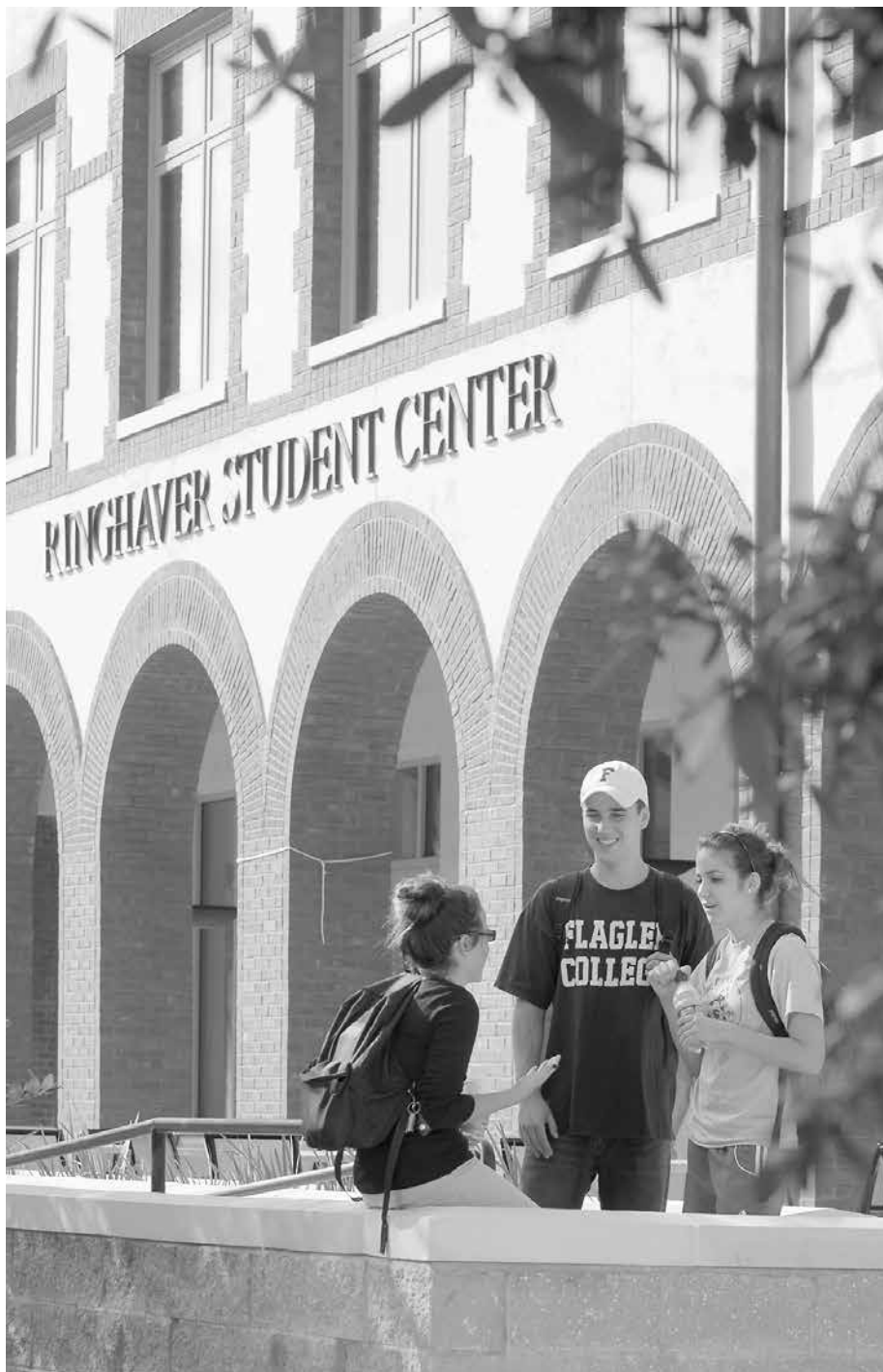
The Ringhaver Student Center provides areas for student interaction outside of the classroom, with three lounges, game tables, a food court, the College Bookstore, classrooms, and a large multipurpose room.