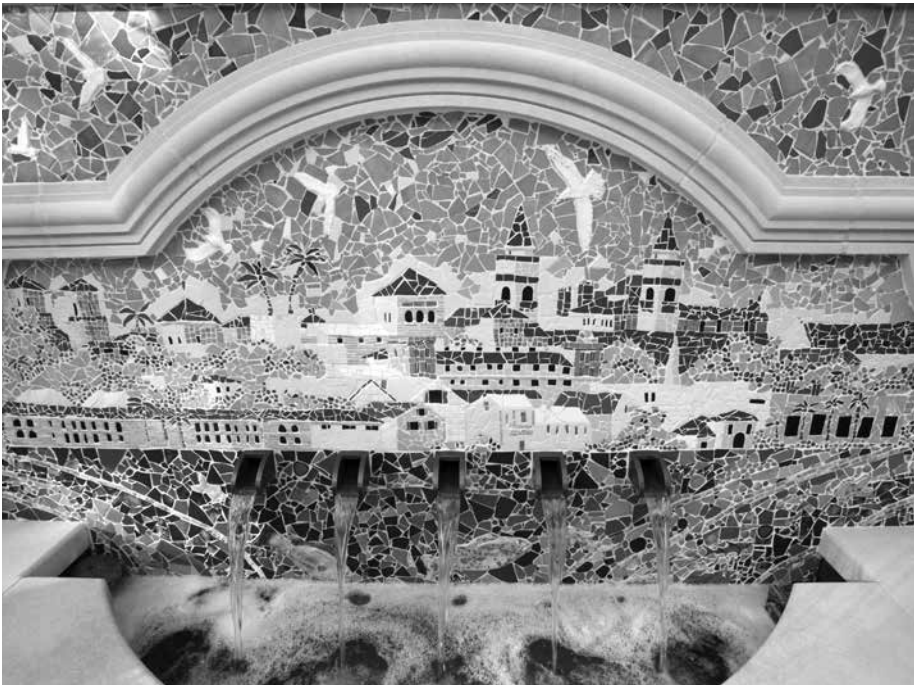
Above: Hanke Hall, which houses the Admissions and Financial Aid offices. Below: The 30 foot mosaic inside the courtyard of Hanke Hall. This mosaic was designed and executed by students from Flagler College's Art Department.