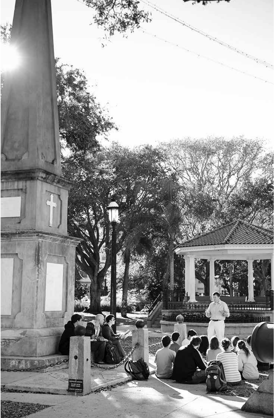
Flagler College students enjoy class outside in the Plaza de la Constitución, located in the heart of downtown St. Augustine.