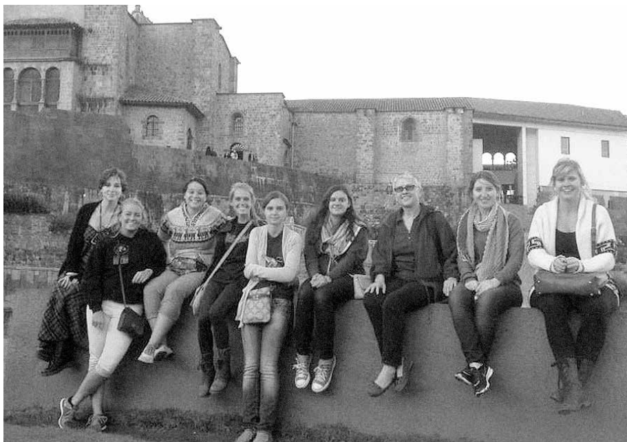
Students and faculty share unique learning experiences in the Study Abroad Programs, which combine touring with instruction in rich cultural settings.

independent study prior to the beginning of a term or during the official add period. Students registering for an independent study course will be charged an additional fee of $50. Independent study forms are available in the Office of the Registrar.