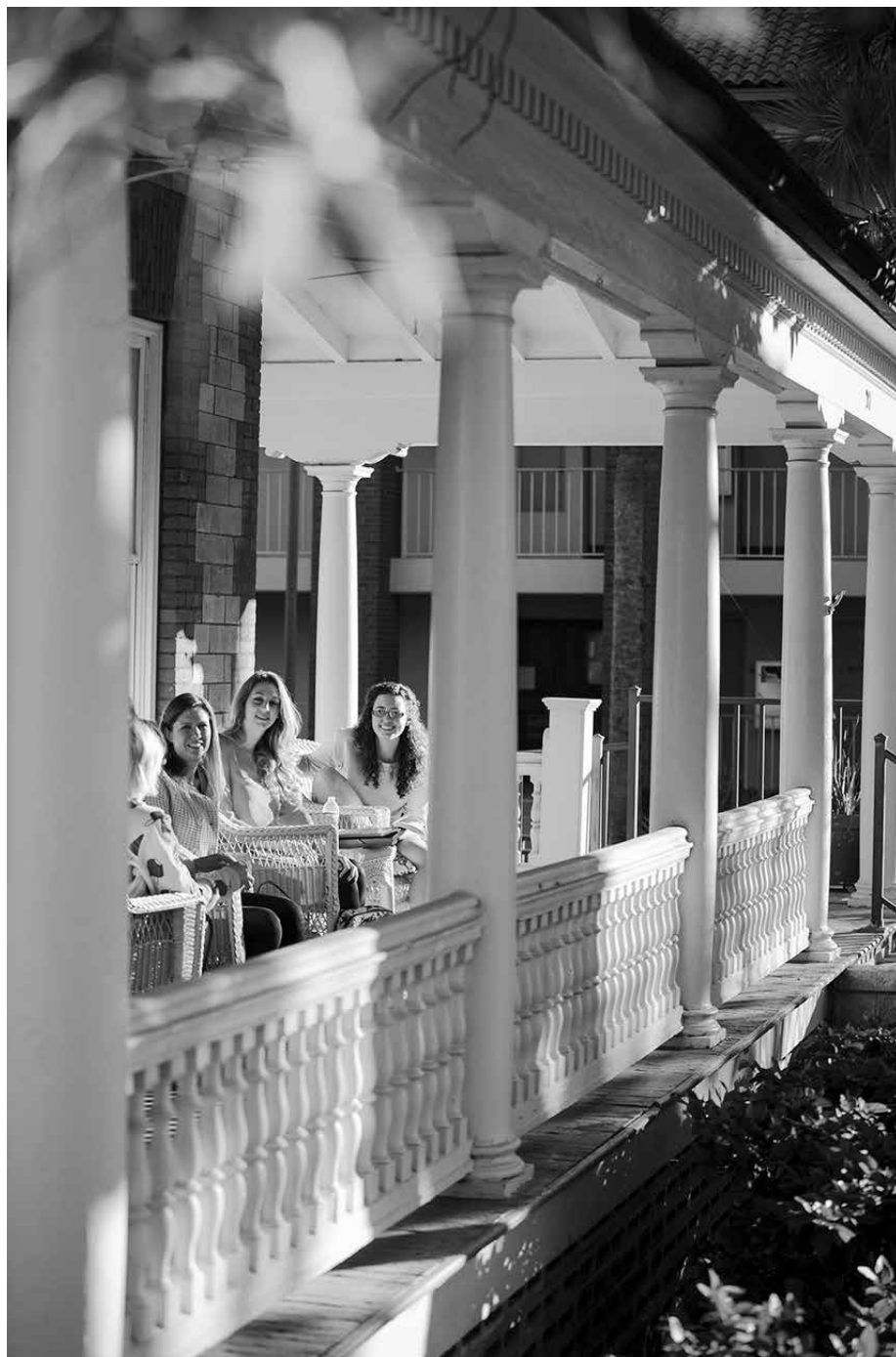
Flagler students enjoy an afternoon study session.