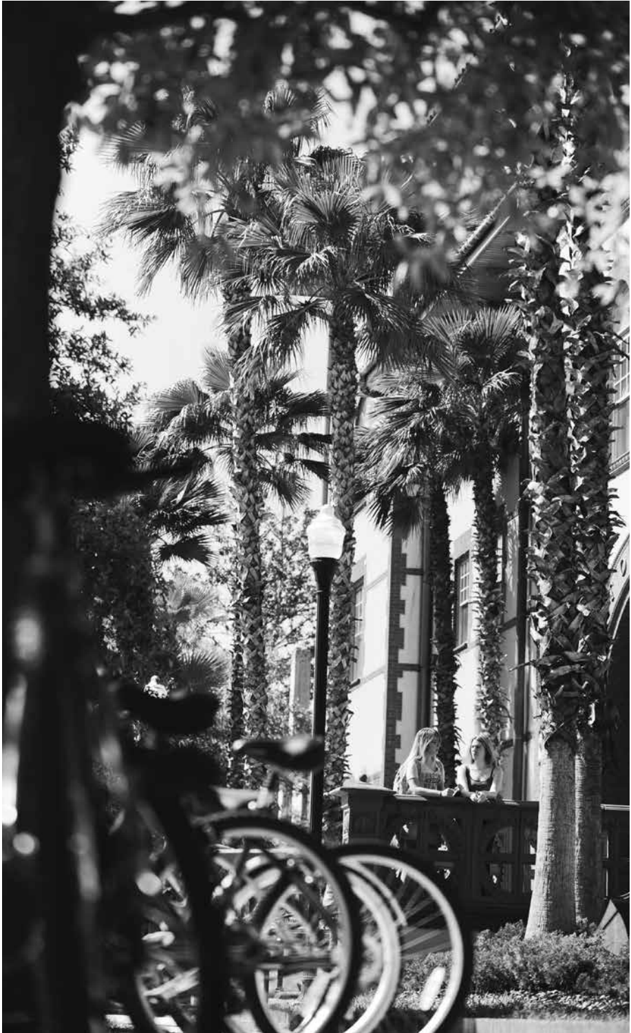
Students enjoy the lush surroundings that encompass the college's campus.