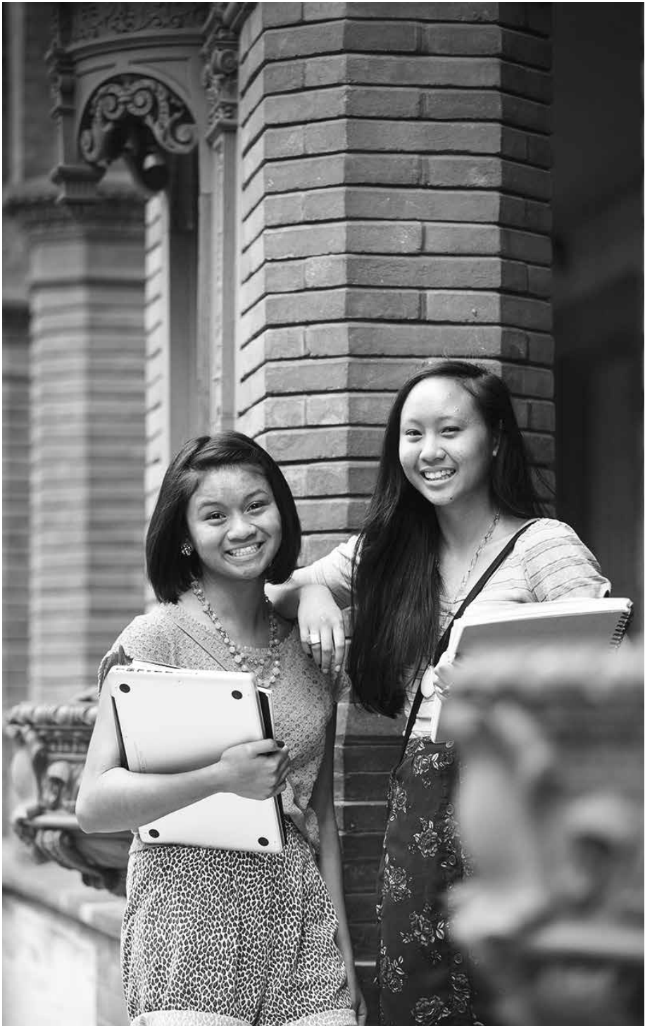
The distinctive Flagler College campus is located in the heart of St. Augustine, the nation's oldest city, and is close to numerous points of historic interest.