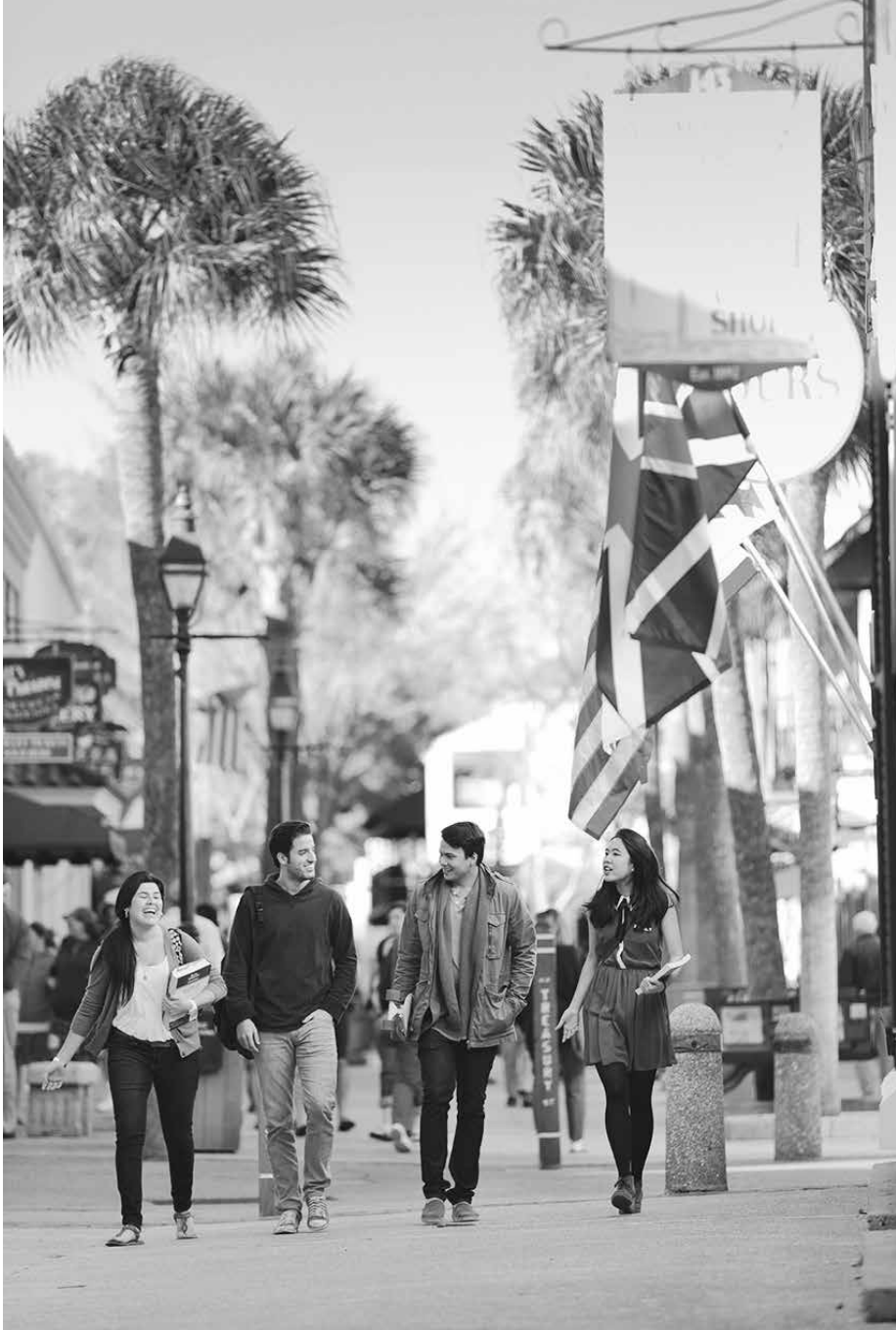
The Flagler College campus, in the nation's oldest city, is within walking distance to the restoration area and other historic points where students love to spend their free time relaxing and socializing.