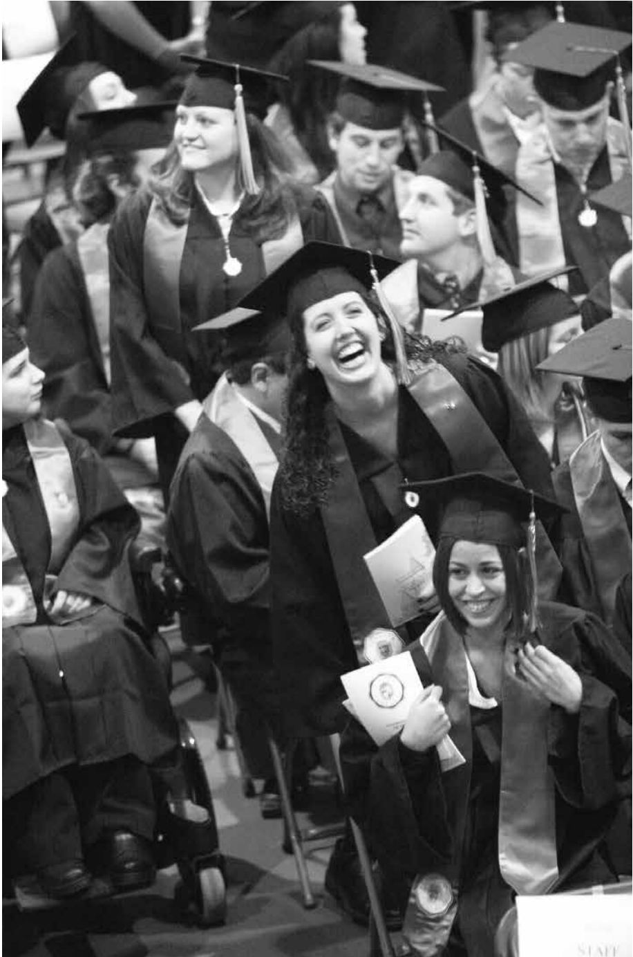
Each Flagler College student's educational experience culminates in the opportunity to march with fellow graduates in a formal commencement ceremony.